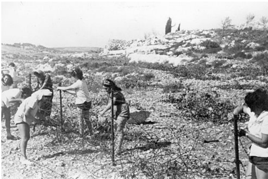
The beginning (1948). My mother is on the far left.

I learned to appreciate every square meter of those rocky terraces and the plentiful they can produce and generate for carrying hands.