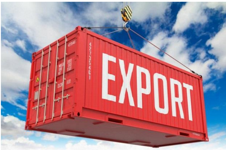
Exports of fresh agricultural produce

By focusing on export , we ensure that agricultural development will be based on high standards and will be highly profitable for those who engage in it. It also provides a sustainable incentive to local governments in the form of stable a current of incoming foreign currency.