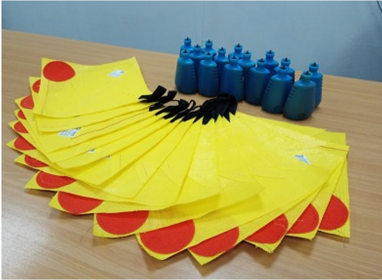
SFR based technology. 150 units per hectare, 2010