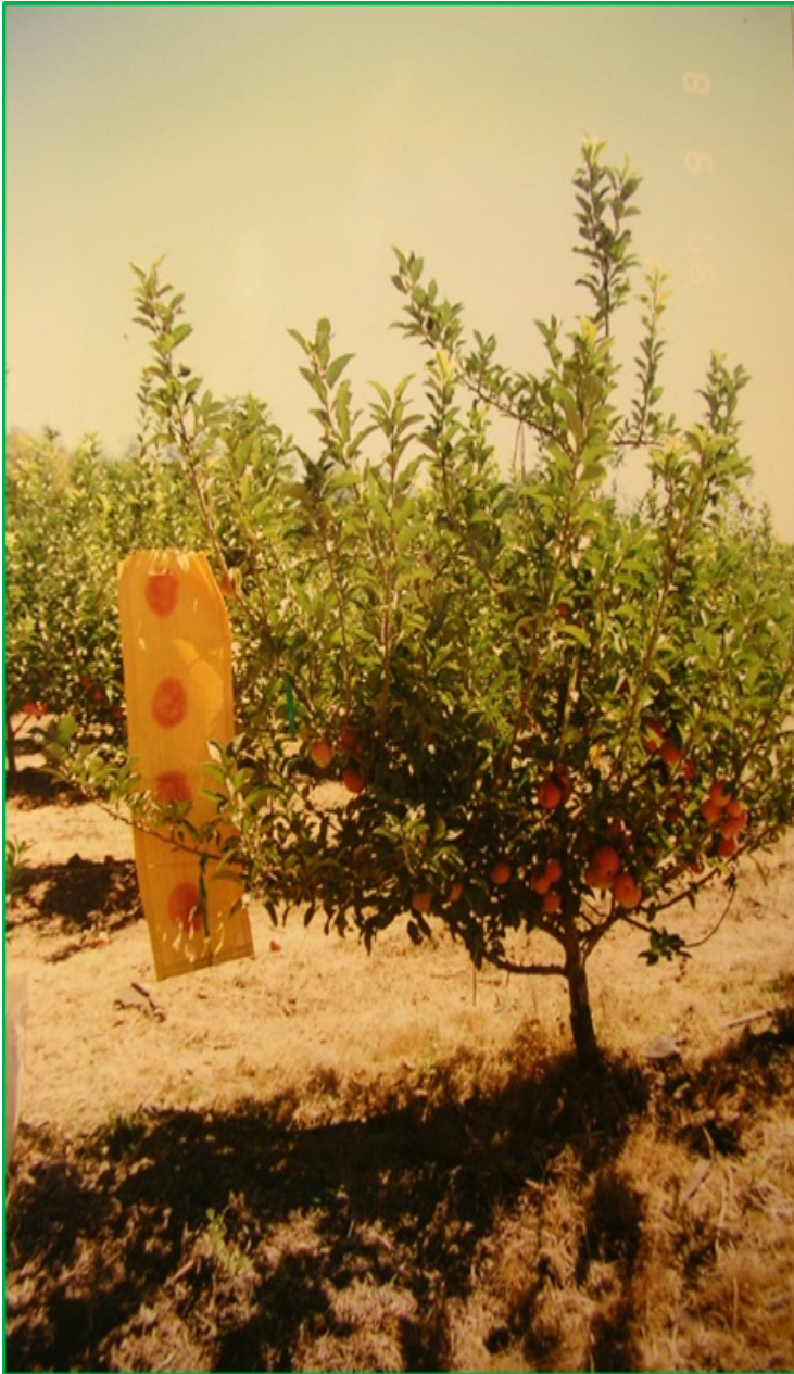
Early steps, 1996