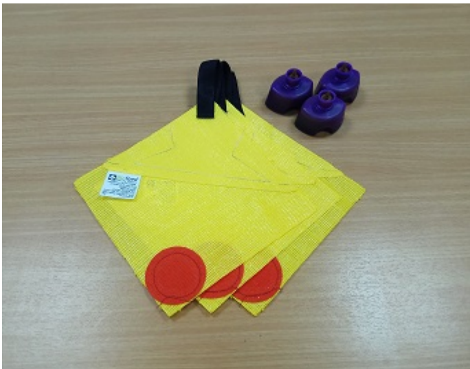
GCFR based technology. 10 to 30 units per hectare, 2017.