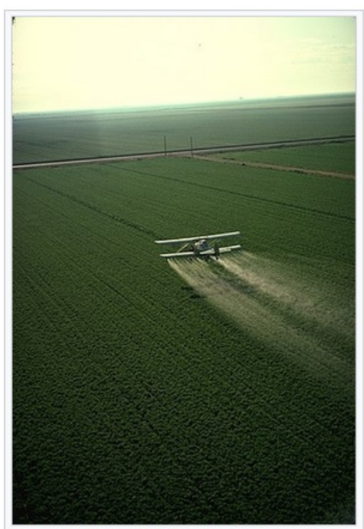
After the Second World War, increased deployment of technologies including pesticides and fertilizers as well as new breeds of high yield crops greatly increased global food production.