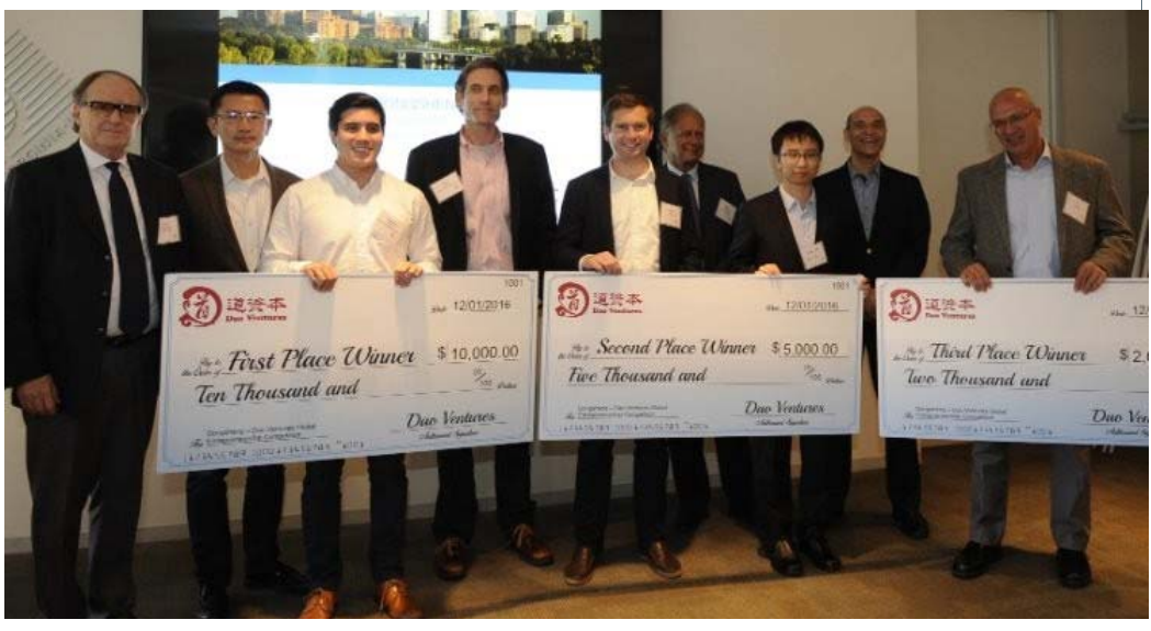
Winners of the Dongsheng Dao Ventures US-China Entrepreneurship Competition 2016