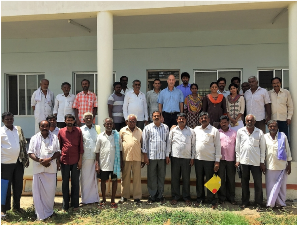
Farmers training, (Chintamani, June 2017).

I would love to see Biofeed brings value to India and its farmers. I know we will do it and I know it will be soon!