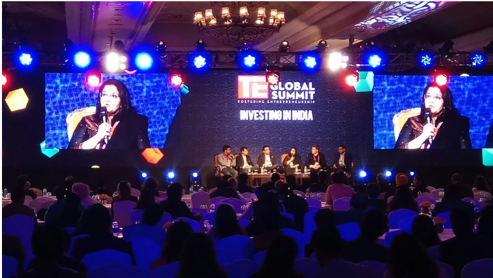
TiE Global Summit, Investing in India. Great focus on AgTech (New Delhi, November 30th 2018).