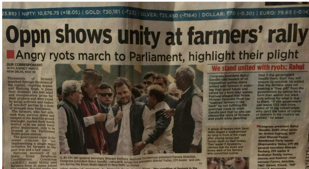
Indian opposition in the press (December 2018).

No matter what newspaper I opened, I always saw the Indian opposition standing with the farmers, using the situation to mock PM Modi for what they present as his failure.