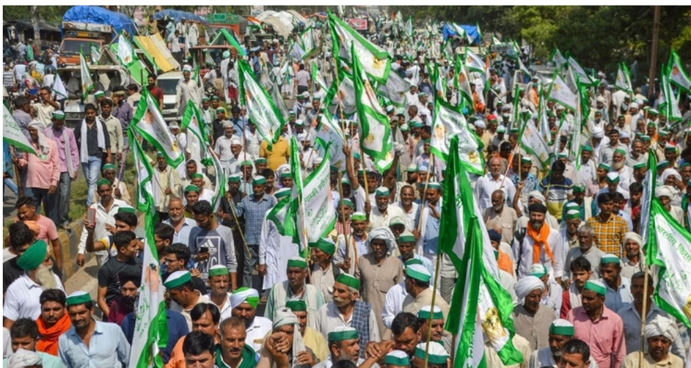
Farmers' rally set to enter New Delhi (2018).

Farmers: about 60% of India's 1.25 billion population is living out of agriculture. However, they contribute only 15% to the nation's GDP with about 31% of the workforce. The average income of farmers in India is around 85 $ per month (2.84 $ per day).