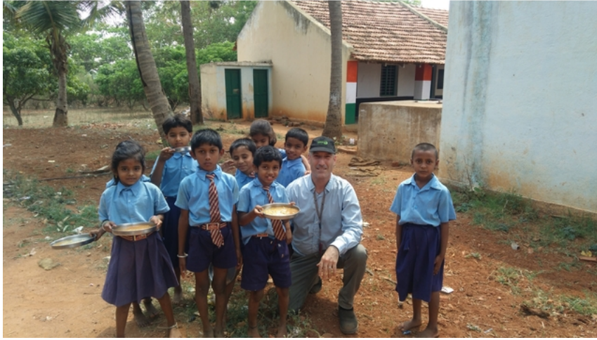
Karnataka, site #2 - an elementary school inside one of the mango orchard (2015 ).

I felt very good (I am sure it was very much thanks to my good friends and development partners Kempmann Bioorganics), and 3 months later we completed the field study with the phenomenal results of 95% fruit infestation decrease by Oriental Fruit Fly, Bactrocera dorsalis .