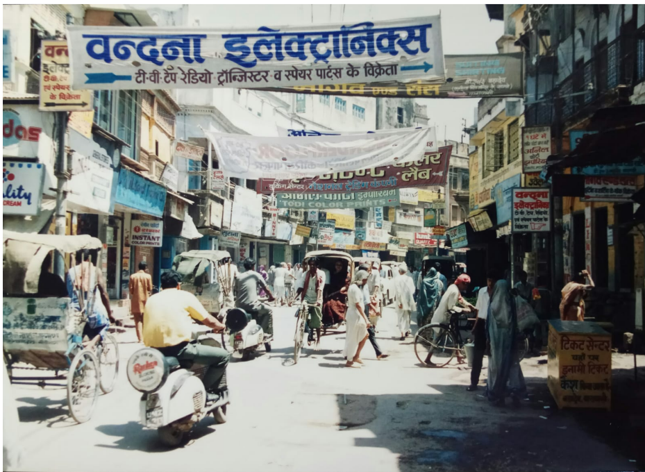
How many cars do you see? India (1991)

Forced out? Yes. I simply couldn't breathe, I felt suffocated. Maybe it was the bad air quality that affected my health in a troubling way. Anyhow, I arrived at Calcutta and got on the first outgoing flight.