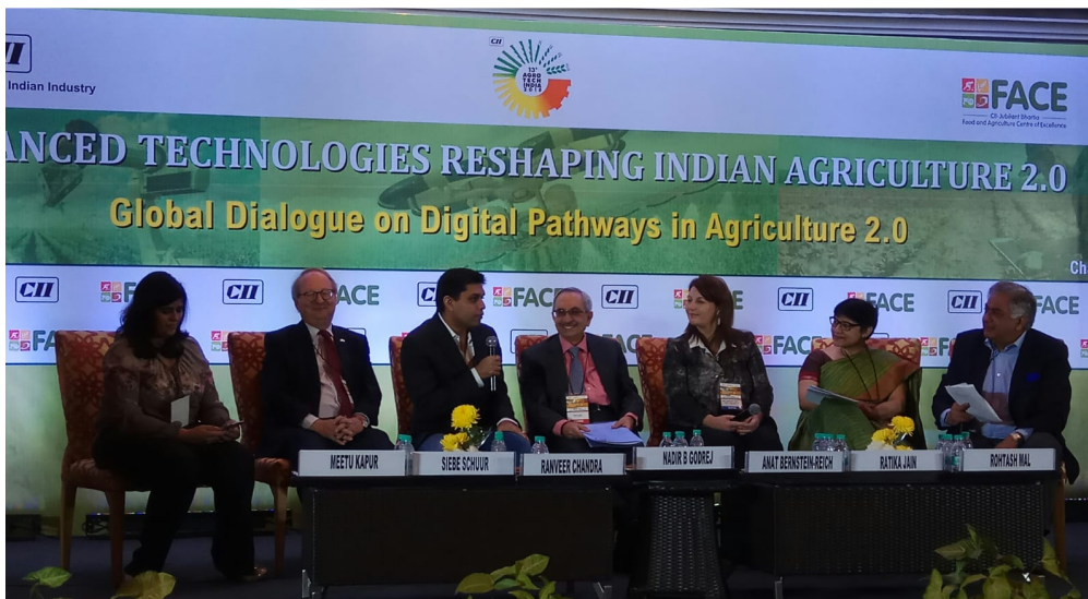
CII (confederation of Indian industry), FACE (food and agriculture center of excellence) and Agro Tech India (agri & food technology fair). Focus on AgTech (Chandigarh, 1-4 December 2018).

Farmers of India has very little to lose because they make so little. So prosperity will not be achieved by teaching them how to save money. This they already know too well, but it got them nowhere.