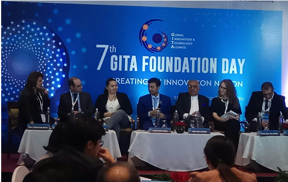
GITA 7th Foundation Day focus on agriculture (New Delhi, November 29th 2018).

With so much good energy and goodwill, there is no question as to where India is going, the only question that remains open is - how fast.