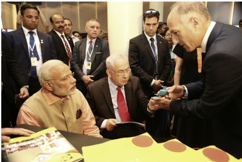
Meeting PM's of India and Israel, Mr. Modi and Mr. Netanyahu (July 2017)

One thing is for sure, the meeting with the PM's (followed by a second meeting 6 months later) has changed my life!