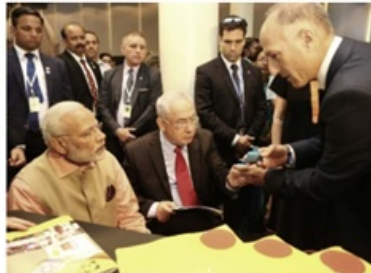
Dr. Nimrod Israely with Prime Ministers Modi of India and Netanyahu of Israel at launch of two CropShield Solutions for AWM project for mango growers in India

Biofeed's GCFR proprietary technology is best suited for area-wide management (AWM). AWM was developed in the 1950's as way of applying S.I.T. Today it is endorsed by the UN, IAEA, the Gates Foundation, USA and EU agencies, etc. for control of flying pests, such as fruit flies, moths, mosquitoes.