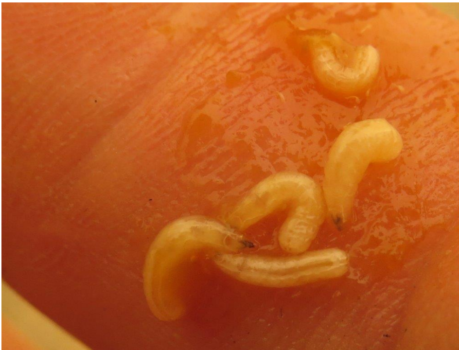
Fruit fly larvae

I learned about IPM and we even had some success with managing various types of pests, but not the fruit fly. With fruit flies the results were catastrophic , with high infestation rates and no effective control despite heavy spraying and dispersion of poisons.