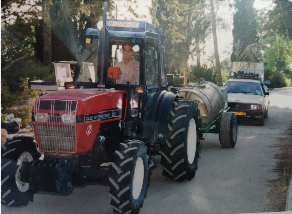
Driving one of the tractors I used for spraying

The first major experience that was part of this formulation was what I learned during my military service. This was during the Iran-Iraq war, at its height (or more accurately, at its depth) with extensive use of gasses.