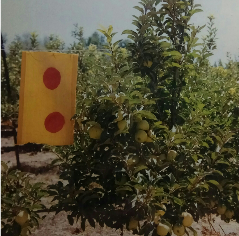
A working prototype before the tractor accident (I had to spray on it every second day)