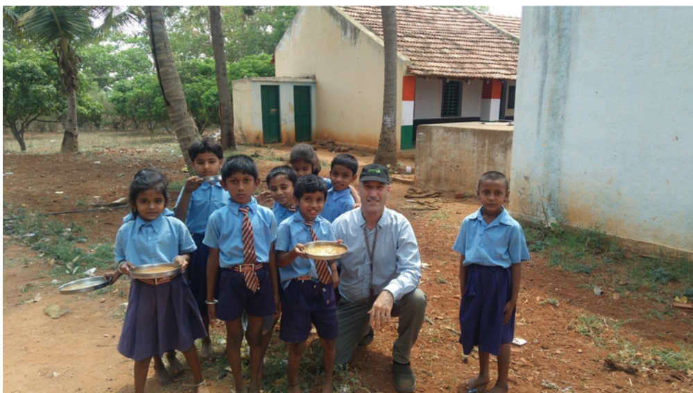
Indian kids with me at Karnataka. School and agriculture are mixed together.