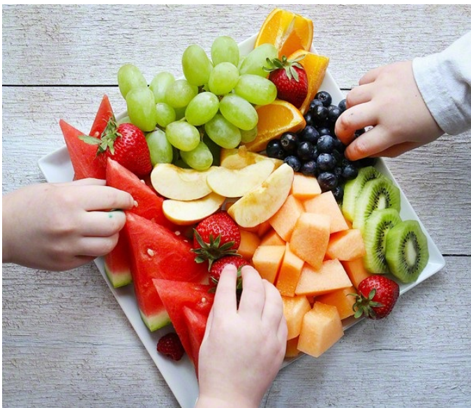
People are looking for year-around larger variety and healthy food.

Fortunately, a large part of the world's population has become more resourceful and is looking for healthier food. This includes most of Europe, USA, and Japan, but that trend is also true and growing (very) fast in Asia and Africa.