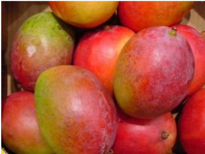
High quality mango, healthy, non GM and free of spraying.

Where there is a need/problem, there is an opportunity. This is the gap that Africa and Asia can fill up by supplying that need for the benefit of all.