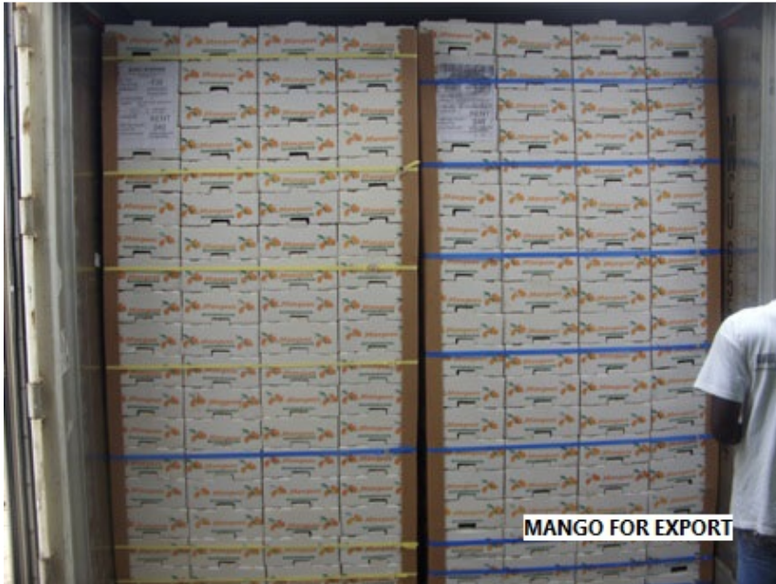
Mango pallets for export