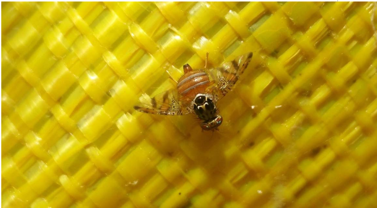
Mediterranean fruit fly on a Biofeed device (Nimrod I.)